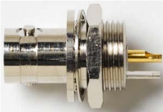
Model 6741 BNC (F) Bulkhead, Isolated ground